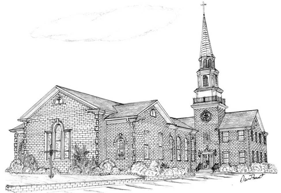
Center United Methodist Church

Office Hours: Monday - Thursday 9:00 AM – 2:00 PM